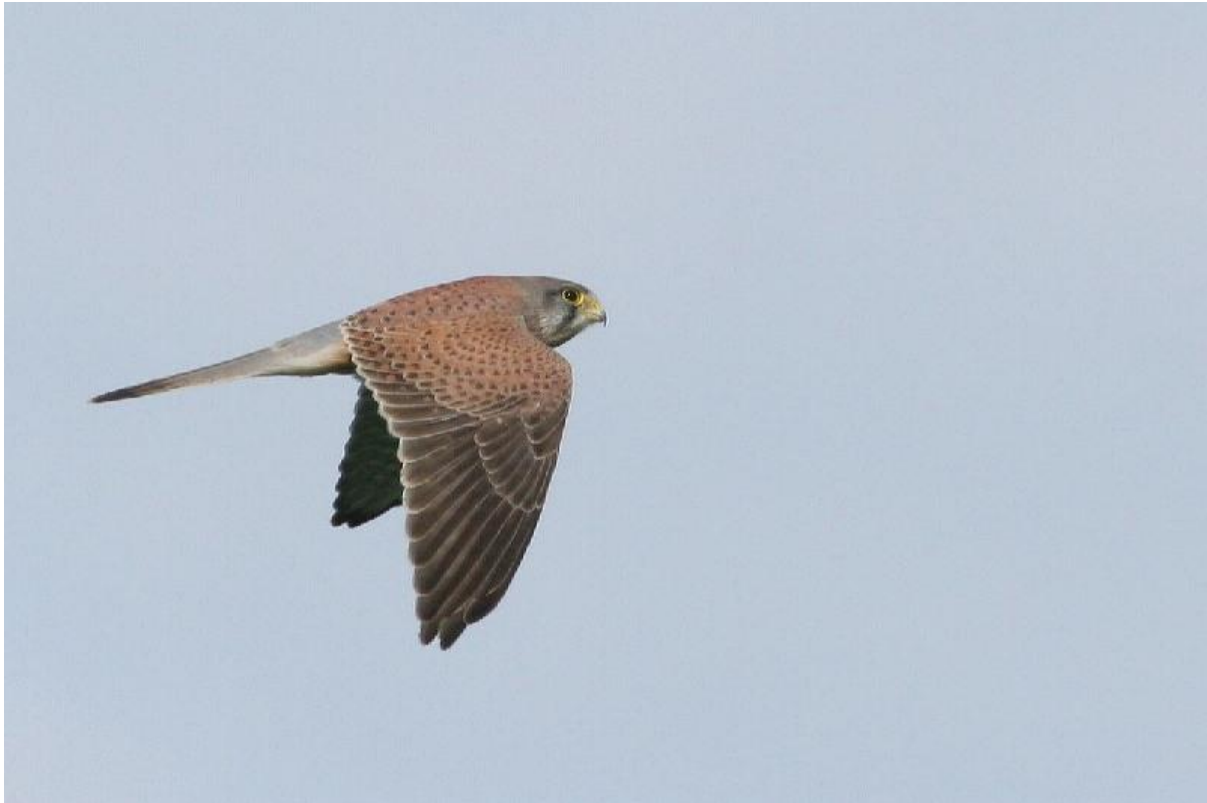
Migrating Kestrel, De Horde, Netherlands.