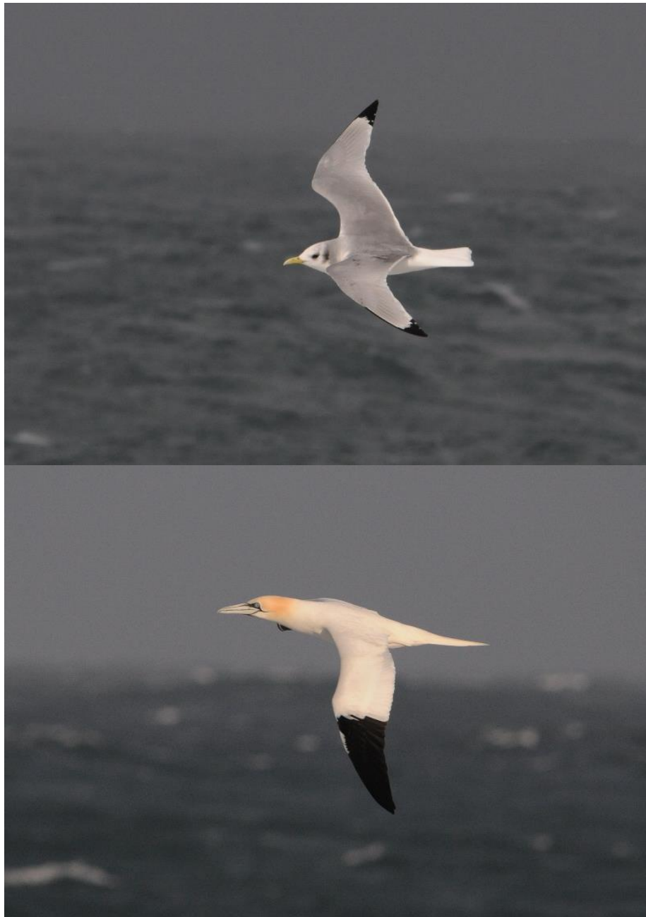
Kittiwake and Gannet, Rubha Ardvule, S Uist. The dark and stormy seas of the west coast of Scotland make a great back drop for seawatching.

of Britain move in a northerly direction, particularly the more pelagic species such as the shearwaters. This is thought to be the result of birds reorientating after having previously been displaced into the southern North Sea by strong northerly winds.