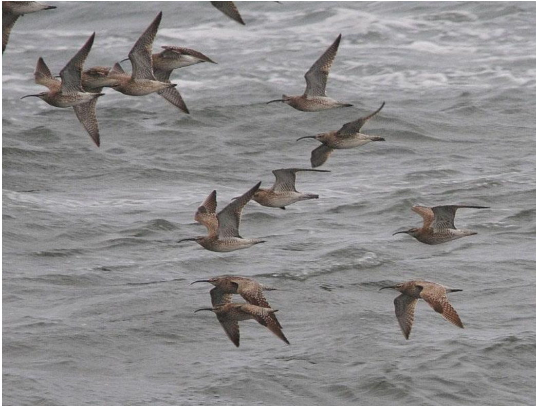
Whimbrels from Iceland passing Rubha Ardvule, South Uist 17th August 2013.