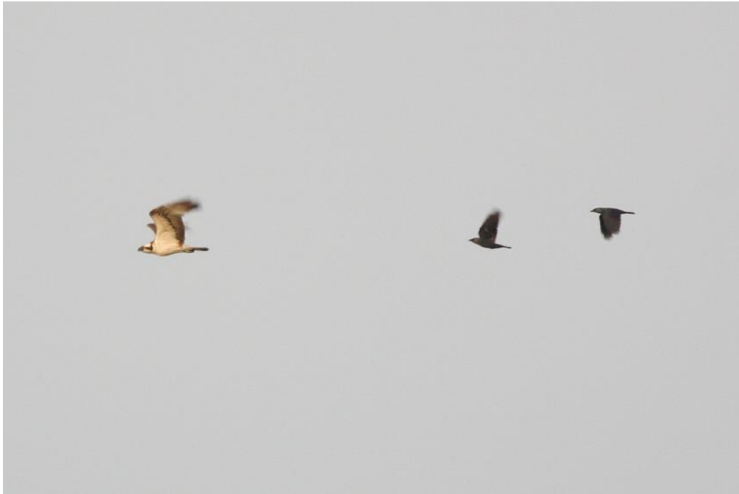
A migrating Osprey at Anglers Country Park, W Yorks , mobbed by 2 Jackdaws.

raptor migration that I've seen was on the island of Kythira, just off the southern end of the Peloponnese peninsula in Greece - the last point before departure across the Mediterranean to Crete. A line of cliffs providing updraughts acted like a magnet to the migrating raptors, and sitting in the sun on top of these cliffs gave exceptionally close views of migrating Booted and Short-toed Eagles, Honey Buzzards, Hobbies and harriers, not to mention a good sprinkling of herons and egrets. Next time you head for the sun, take a good look at the map and see if you can find your own raptor funnel.