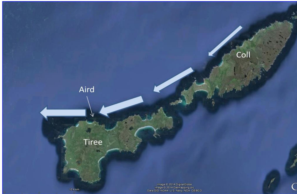
The leading line of the north coasts of Coll & Tiree pushes birds westwards, bypassing sites on the west coast of Tiree.

Never the less, despite all this talk of leading lines and smooth coastlines, not all sites follow these rules, and there are occasions when it seems that the more a site sticks out into the sea, the more seabirds it gets e.g. Cape Clear in Ireland. I think there are days when specific weather systems combine to produce something akin to seabird “falls”, when mist, rain or fronts bring birds close to shore, sometimes with dramatic results. Martin Scott and Tristan ap Rheinallt witnessed one such event at the Butt of Lewis on 8 th September 2007 when a staggering 7, 114 Great Shearwaters (and one Cory’s!) passed north westwards out of the Minch.