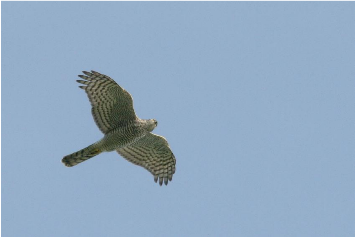
Migrating Sparrowhawk, De Horde, Netherlands.

The three most commonly recorded British raptors during 2005-2013 were Kestrel (1,702 records in total, of which 833 came from Spurn, including a staggering maximum count of 54 on 15 th September 2010 ( a British record?) , Sparrowhawk (2,958 individuals, many of which were at Dungeness including the maximum of 52 there on 23 rd August 2008) and Common Buzzard (2,083 individuals, maximum 70 >S at Spurn on 3 rd Sept 2010). Most of these counts probably involve dispersing young birds rather than true migrants, although some of the high counts of Buzzards and Kestrels suggest that some continental immigration may be involved. It is notable that raptor migration in the UK is an early autumn phenomenon, starting in mid August and peaking by mid September. So if you're seeing raptors pass over you at this time of year, don't assume they're locals! There is still much to learn about raptor migration in Britain, and with the populations and ranges of some species on the increase, more great days to be had.