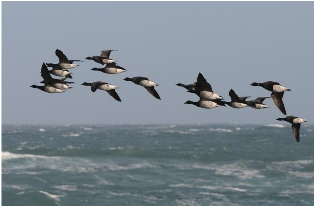
Pale-bellied Brent Geese on their way from Canada to Northern Ireland, Rubha Ardvule, S Uist.

The great thing about visible migration from a bird watcher's perspective is that if birds are moving by day – then provided they are not high in the heavens, then they can be seen by anyone armed with binoculars or telescope. So rather than inferring what birds have been migrating overnight by what turns up in the bushes at dawn, you can actually watch the birds in the very act of migration. And so we can enjoy the magic of migration in action. As the years have passed, my desire to find Thrush Nightingales and Blyth's Reed Warblers has waned, but my appetite for connecting with migration in action has grown ever stronger. Every migration journey is a minor miracle of endeavour and navigation, each worthy of an Olympic medal. But I'd rather watch Usain Bolt in the act of running the 100m final than see him standing around receiving his medal "after the event". So it is that I, and a growing band of "vismig" watchers have become tuned to observing visible migration rather than turning up for the medals ceremony for nocturnal migrants whose achievements cannot be witnessed. Whilst Eastern Crowned Warblers will always take the Gold Medal for most birders, the real magic of bird migration for me is connecting, however briefly, with the amazing journeys that can be seen in action.