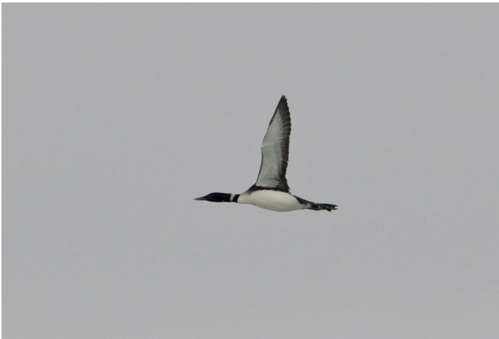
Great Northern Diver in summer plumage. Rubha Ardvule, South Uist.

And visible migration can be witnessed across the country, it is not the preserve of east coast headlands and remote islands. I have been enthralled by flocks of moving thrushes and finches in the valleys of the Peak District, Pale-bellied Brent Geese, Great Northern Divers and Sabine's Gulls off the coast of Islay in westerly gales, Whooper Swans and Woodpigeons on high pressure days in the Angus Glens and Meadow Pipits, Kestrels and Marsh Harriers following the peninsula at Spurn on sunny days in September. Further afield I've watched swifts, Black Kites and Cuckoos passing through Alpine cols, flocks of Great White Pelicans and Steppe Eagles over the desert coast of N Sinai, Honey Buzzards starting their northward spring journey to Europe over Cameroonian rainforests, and Woodpigeons, Little Gulls and Common Cranes on their way to Finland braving Baltic snow showers on the Latvian coast in April. Whatever the species and location, good vismig days are like having a front seat at the Olympics.