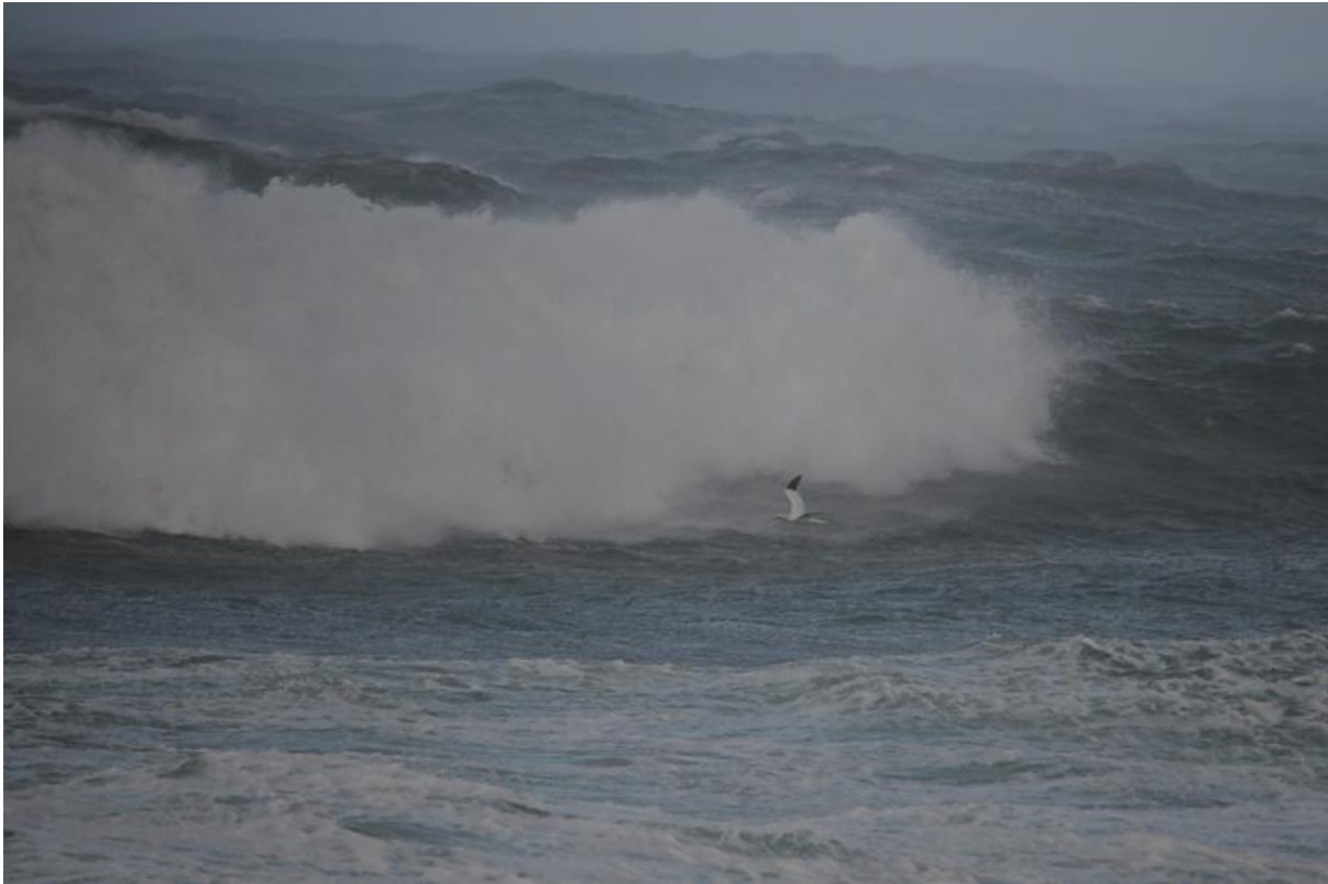
A lone Gannet at Rubha Ardvule, South Uist captures the atmosphere of a seawatch on a stormy day.