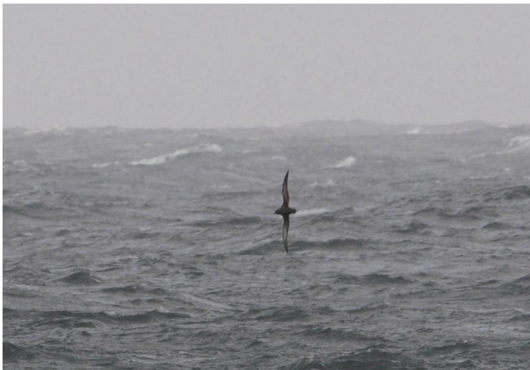
Top birds on any seawatch: Leach's Petrel, Corsewall Point, Dumfries & Galloway and Sooty Shearwater, Rubha Ardvule, S Uist.

One of the great things about seawatching is that there is always a variety of other species on show. Flocks of ducks and waders from July onwards, Pink-footed and Brent Geese in September and Whooper Swans and Great Northern Divers in October. Identifying birds at sea is a particular challenge, and familiarity with your site and your species seems to be the key to success.