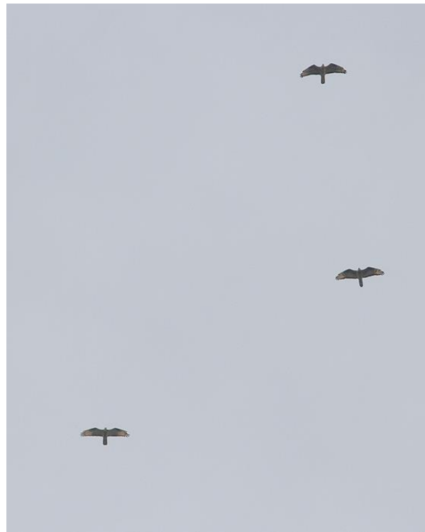
Migrating Honey Buzzards, De Horde, Netherland, showing the characteristic wing shape and pigeon-like heads .