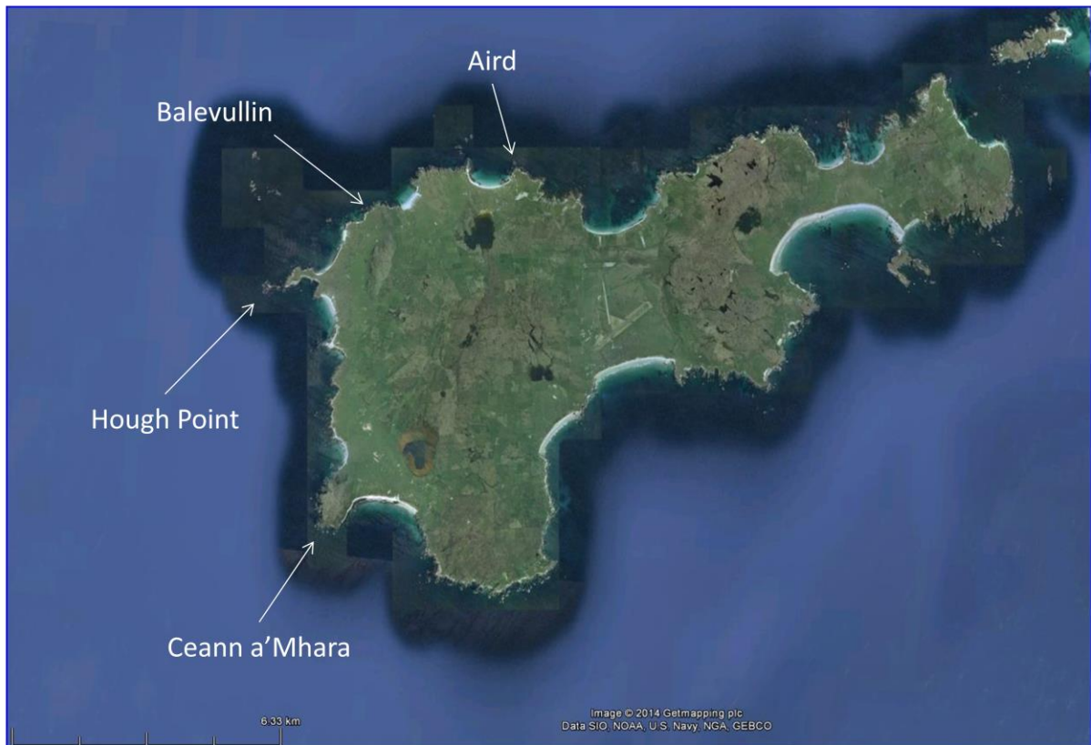
Four autumn seawatching sites on the island of Tiree, Argyll. Image: Google Earth.